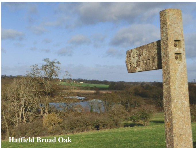
Hatfield Broad Oak

The spring of 2024 was rather wet, and this resulted in poor establishment of autumn-sown cereals. This, combined with the inclement conditions during harvesting, resulted in disappointingly low yields. However, it seems that with dry weather in the autumn of 2024, the sown wheat, barley and oats have germinated well, with most fields now covered with fresh green shoots.