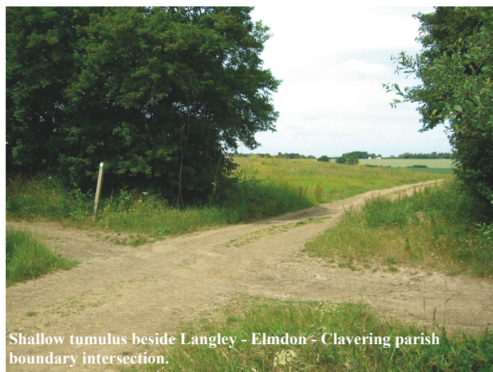
Shallow tumulus beside Langley - Elmdon - Clavering parish boundary intersection.

The highway which is the focus of this book is one of several local routes with Roman origins. Many feature somewhere in the walks that can be downloaded from www.hundredparishes.org.uk .