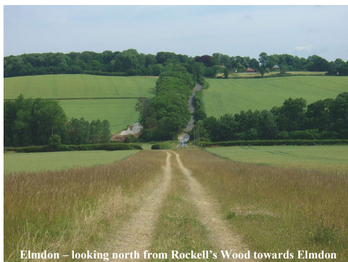
Elmdon – looking north from Rockell's Wood towards Elmdon

Much of this route can be walked still; the actual Roman road is most visible as Beards Lane where it defines straight parish boundaries, with Clavering and Arkesden to the south-east and Langley and Elmdon to the north-west.