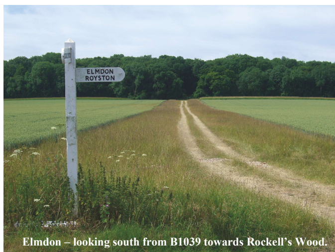
Elmdon – looking south from B1039 towards Rockell's Wood.

Through his words, we gain a glimpse of the civilisation that sited and constructed the road, of the people who used and maintained it and, eventually, of what happens when a road passes out of general use and the legacy it leaves behind.