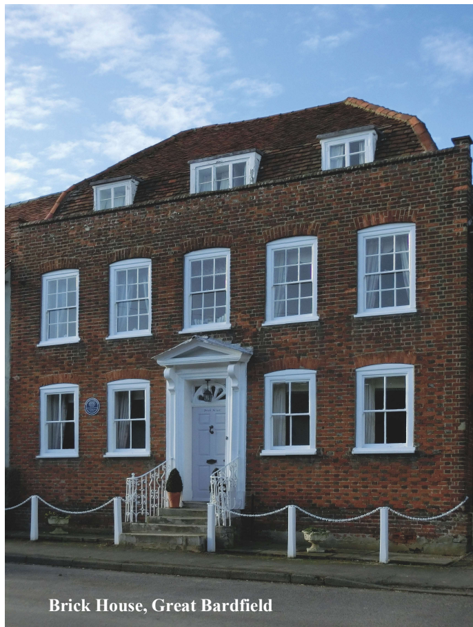
Brick House, Great Bardfield

Eric Ravilious and Edward Bawden were both Royal College of Art students when, on a cycling holiday, they happened upon Great Bardfield in Essex. There, they rented Brick House, starting a fascinating period for the village. Over the next two decades, numerous artists came to live there; they became known as The Bardfield Artists.