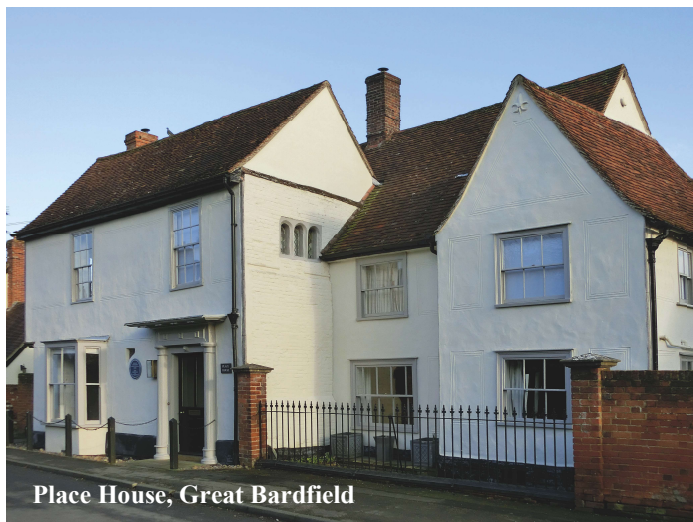
Place House, Great Bardfield