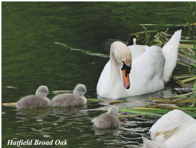
Hatfield Broad Oak

Appreciating tranquillity is an essential aspect of being in the countryside, where it should be possible to scan attractive views of verdant landscapes or cloudy skies, hear natural sounds and catch glimpses of wildlife without intrusive background noises. Evidence gathered over the past 15 years reveals that tranquillity is not just a pleasurable experience but is essential for human health and wellbeing reducing stress levels and lifting spirits.