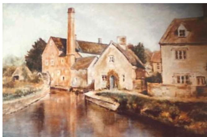
Lower Rissington - Cotswolds - by Brian Gough

Bookings 01279 871989. reservations@labonta.co.uk Unit 6, Priors Green local centre, Bennet Canfield, Dunmow, CM6 1HE.