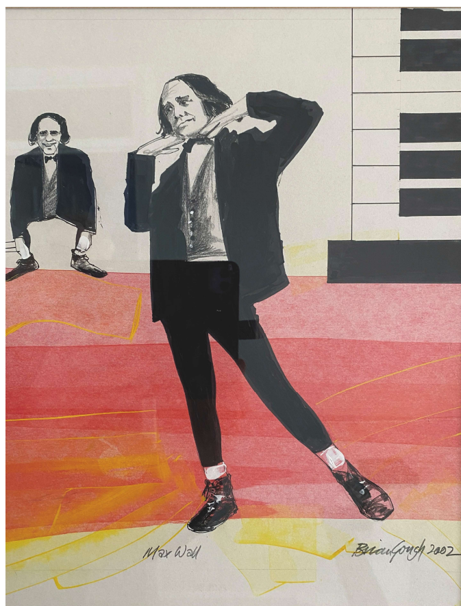
Max Wall by Brian Gough

It certainly seemed like it with footpaths impassable, fields flooded, lawns a soggy mess, endless winds, and seemingly extra wet rain. Even the dog hoped we'd forget the drag which the daily walks had become. We seem to go from one weather extreme to another. Lack of rain, then too much of it, strong winds bringing trees down all over the village and cold nights with their unexpected frosts. We could just say that is what winter is all about and that the run of mild winters has softened us up. At least here the expected snow failed to arrive, so we had to expect something else and just get on with it, that's winter! Well spring is here officially now. At least the daffodils are as good as ever, for now anyway, anyone heard of climate change?