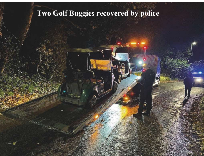
Two Golf Buggies recovered by police

Why? No reason it seems, other than the enjoyment of wilfully causing damage to other people's property! Thankfully the gate held, so that even further damage was avoided. The police attended the scene and arranged for a recovery truck to return the buggies after taking forensic evidence. We live in hope that the police will find the hooligans.