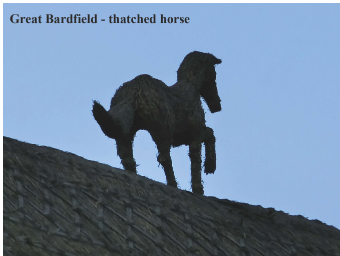
Great Bardfield - thatched horse

The 16th-century Thatchers pub at Hatfield Heath is appropriately situated on a road that was once part of the route for horse-drawn cartage of wheat from Suffolk to London. Do keep looking up!