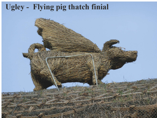
Ugley - Flying pig thatch finial

Pheasants and foxes are still among the favourites for this tradition that goes back centuries. These finials may once have been installed to keep away birds or even witches, while some may have been the trademark of the individual thatcher. Today, they are more likely chosen by the customer from an online catalogue.