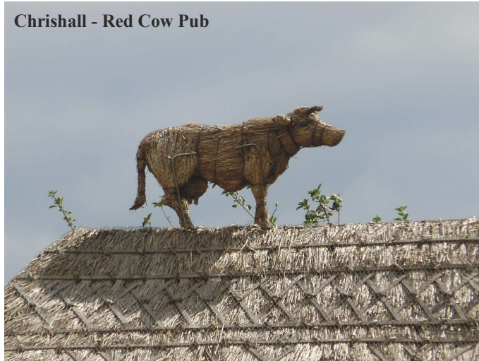
Chrishall - Red Cow Pub

You may see a hare on Dick Turpin's Cottage at Hempstead or a galloping horse at Great Bardfield. High Roding has a delightful cat stretching up the chimney stack and a fox chases a hare in Brent Pelham. An eagle has landed in Aythorpe Roding and there is a flying pig in Ugley.