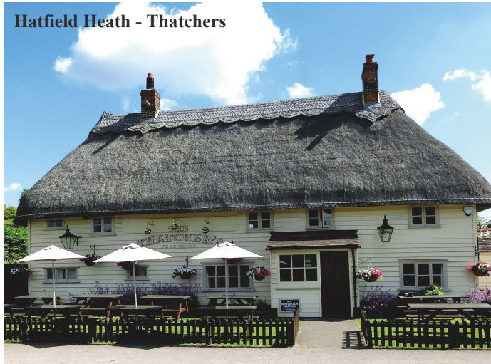
Hatfield Heath - Thatchers

Thatch was once the roofing choice of the poor as it was locally sourced, inexpensive and sustainable; now it seems that only the better-off can afford the necessary regular servicing and replacement. Most roofs are thatched with long wheat straw and many are topped out with a decorative straw feature on the apex. These are called straw finials.