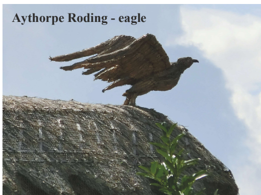
Aythorpe Roding - eagle

They seem to be more abundant and varied than ever.