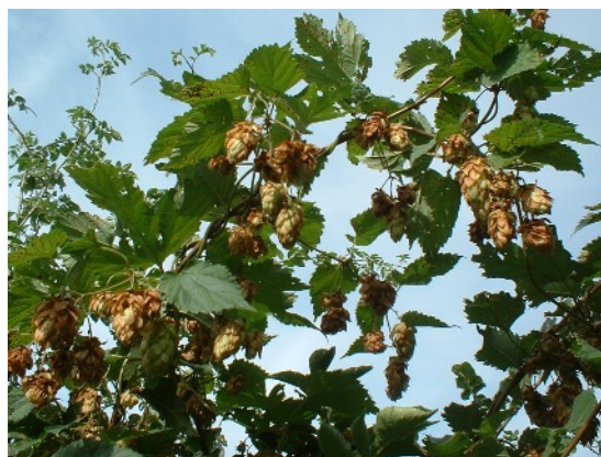
Photograph: Wild hops

The majority of trees were still holding many of their leaves although these were in every shade of green, yellow and through to rust, but only a few were quite void of leaf. Along the fringes of the open fields there were many large toadstools, or field mushrooms, their flat caps open and measuring several inches in diameter. They prefer pasture and do not grow where fields have been sprayed with chemicals. We also saw one butterfly, although from a distance, several deer hoof prints and some hops in the hedging.