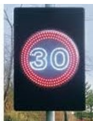
Wig Wag Signs

Birchanger Parish Council states that it will continue to look at all available solutions and are determined to find ways of reducing the speeds of vehicles driving through Birchanger.