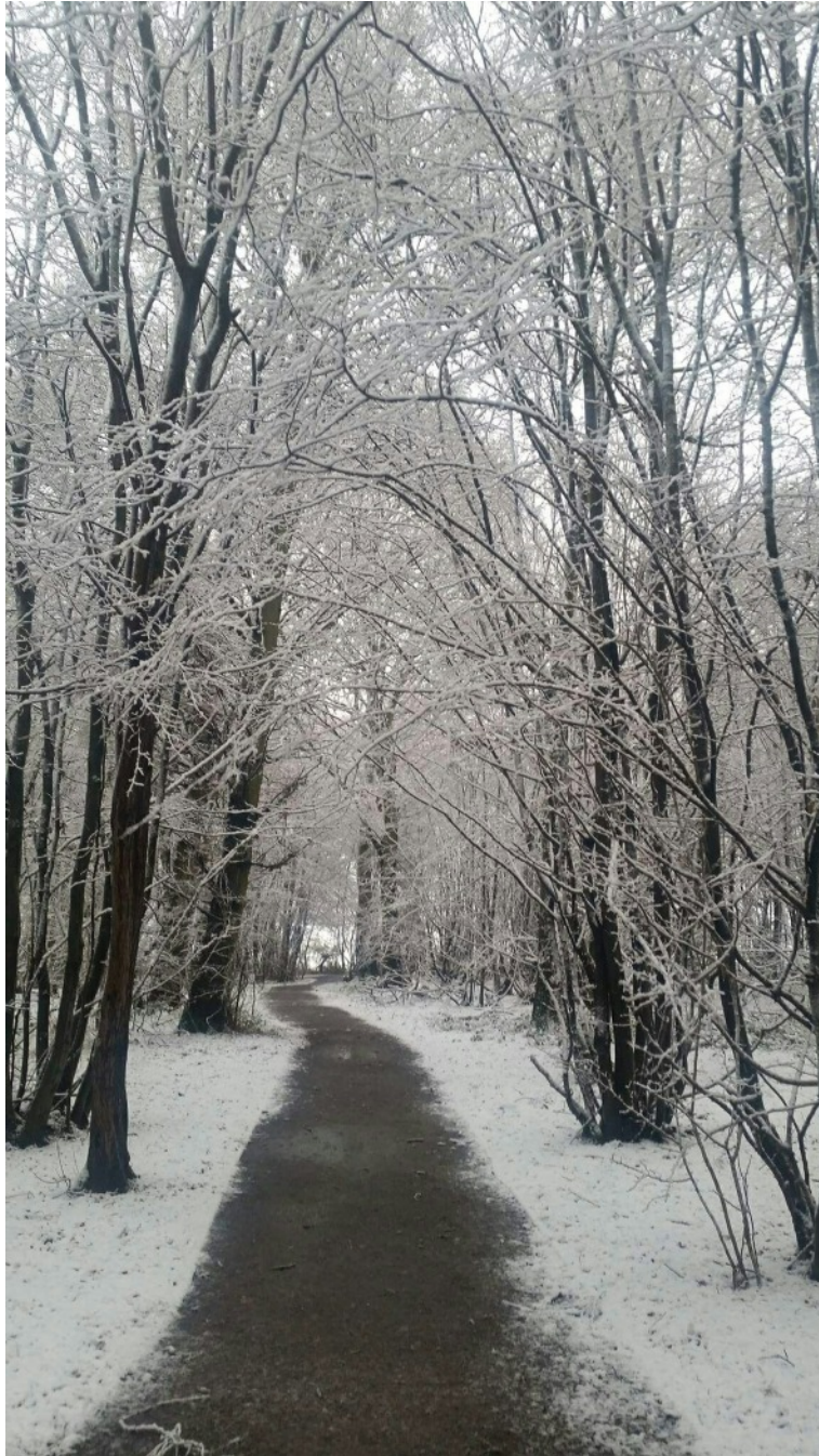
'The Pathway' by Paul Ferret winner of 'The Spirit of Birchanger'