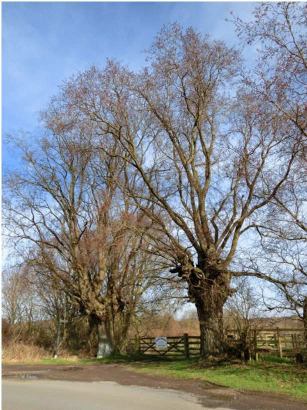
Old pollarded elms in a hedge in Tilty; they are wonderful scarce survivors within the Hundred Parishes.

Hedgerows are a significant feature of our agricultural landscape and were planted in the past as boundaries. Thorny blackthorn and hawthorn made a stock-proof barrier, with hazel, holly and spindle colonising later. Ash, elm, field maple, hornbeam and oak trees were integrated into such hedges and these nurtured specimens were managed as pollards, being cut off at head height on a regular cycle. In 1778 it was recorded that 85 percent of the hedgerow trees in Barwick in the parish of Standon were pollards, so these would have stuck up at regular intervals above the hedges.