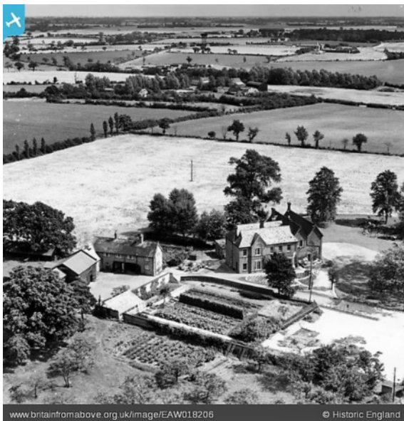
Blacklands Farm, currently the Travel Lodge near the ambulance station.

Compliments of the season to all, Chris Kadwill