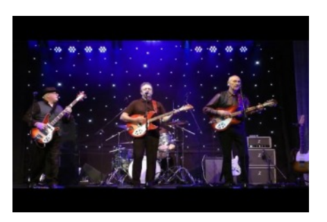
11th July - Blueprint

Essex's favourite party band was formed over 10 years ago and the boys have been bringing their own brand of party music to the people of the South East ever since. Taking the best music from the last 6 decades this band know how to put on a show.