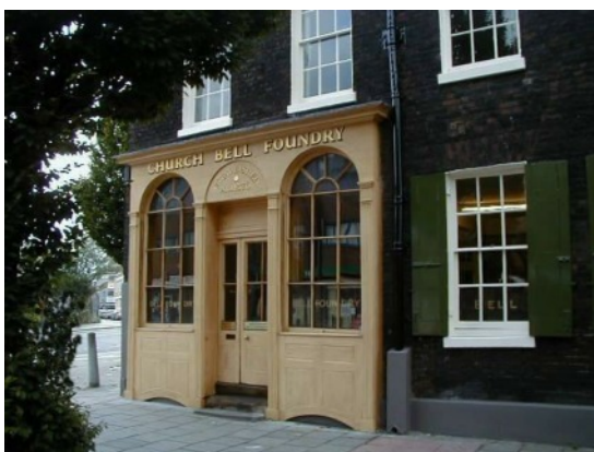
The Whitechapel Bell Foundry