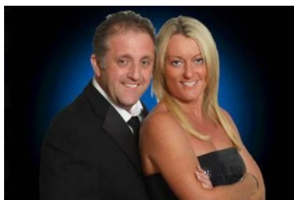
Second to None 14 th Dec