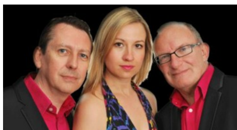
Tequila 30 th Nov

December 31 st Music through the ages – Great Music Disco returning from last Newyear