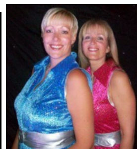
Ruby Groove 24 th