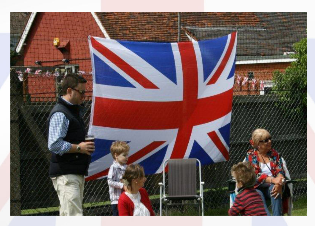
Birchanger Residents proudly display their patriotism at the village Diamond Jubilee celebrations

So - perhaps it's time we started planning for the Platinum Jubilee in 2022. The oak may provide a bit of shade by then.