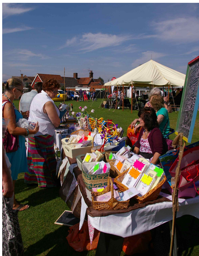
A Stall at the Fete