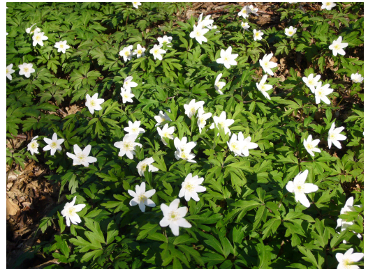
Wood Anemones in Birchanger Wood

Birchanger Wood is 69 acres of ancient woodland through which many people from Stortford and north Essex travel when using the A120 from Hertford to Colchester in order to reach Stansted airport. It is, of course also your local Wood and provides a green lung separating the airport with its further development and urbanisation from the villages of Birchanger and Stansted and the town of Bishop's Stortford. It absorbs noise and creates a place of calm respite, together with a great facility in which to exercise AND IT IS FREE, and is available 365 days of the year.