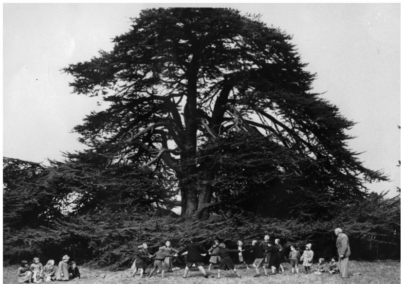
This photo dates from 1901 seven years after the first fete but the closest we have