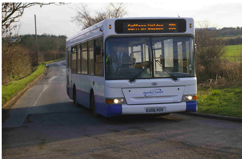
Use it or lose it. A 301 enters the village

The proposals are not expected to be put into place until August onwards. You will be informed.