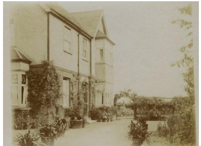
"The Gables" in 1906