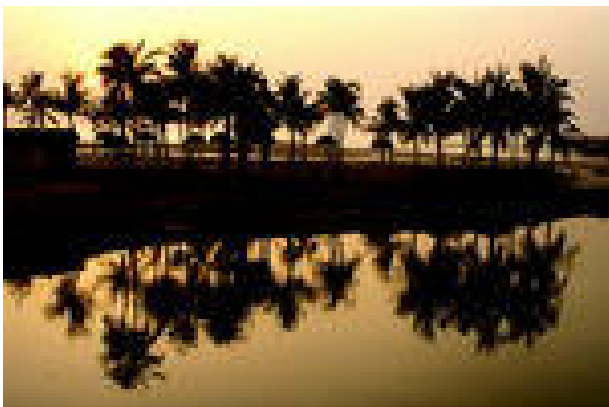
An Omani Oasis

He needs to complete soon and to find another source of income for Oman. There are signs that the oil and gas will run out halfway through this century and in a country where temperatures get to over 40 degrees in summer, where water depends on a certain extent on desalination plants, Oman is going to need to find a new direction sooner rather than later.