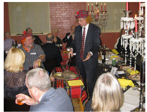
The address to the Haggis

It was then time for every table to make their own contribution to the fun, and they did so by way of favourite poems, recitations and songs written and sung especially for the occasion.