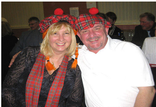
Members of the editorial team

The event was planned as part of a long running programme to fund the case against runway 2 by SSE. In any event nobody allowed the planes or the threat of airport expansion to dominate or to mar the evening.