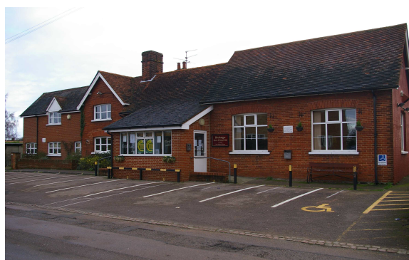
Open on Christmas day

This is a first for the club, and the idea was entirely the stewards' own. The club has never opened on Christmas Day before, and for some it may be a useful alternative to the longer walk to the Three Willows.