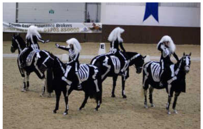
The team in action