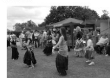
The Egyptian dancers

The village fete returned to the Three Willows garden on Sunday 9 th with an early threat of inclement weather. Happily the clouds parted and by 12 o'clock we were able to open with no problem thanks from the elements.