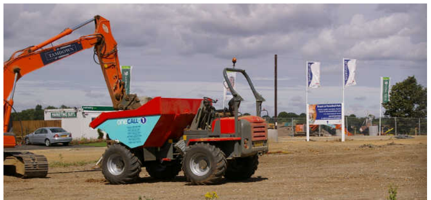
The site at work on August 12th with the Stansted windmill in the background Birchanger Village Magazine 1

The first houses to be built on the Rochfords Nursery site were scheduled to be started at the end of last month as the road works on Pesterford Bridge nears completion. Taylor Woodrow are developing to the east of the site while Croudace are starting towards the north. The first occupancies are expected in the New Year.