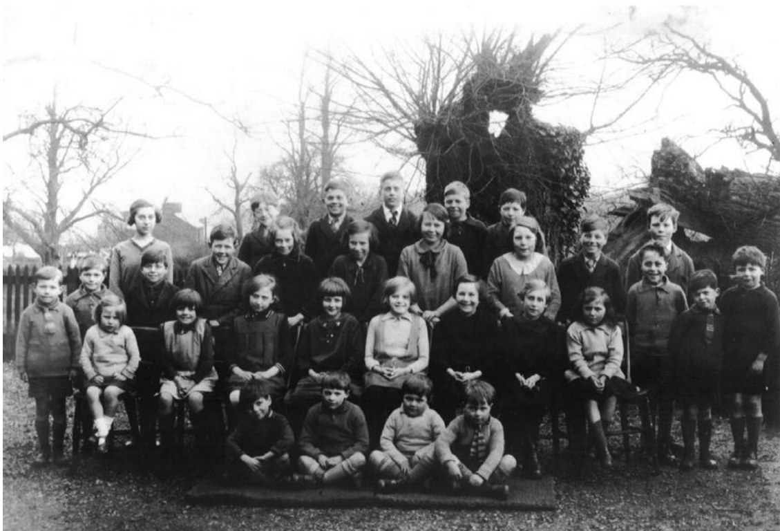
Heres a view of the younger pupils at Birchanger school from 1932 any help in identifying them would be appreciated

I like Domestic Science very much. Next week we are going to take a pillow slip, three handkerchiefs and a towel or tea cloth.