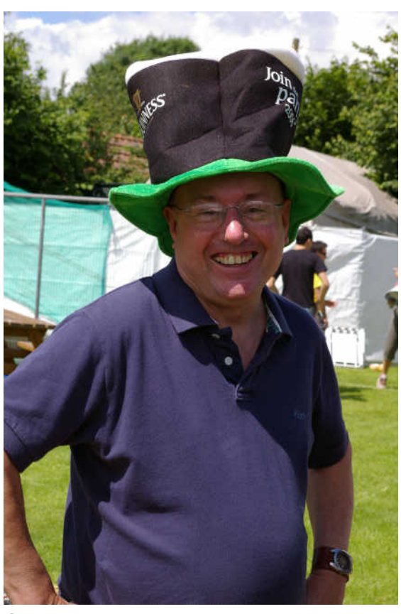
Silliest hat of the day by far