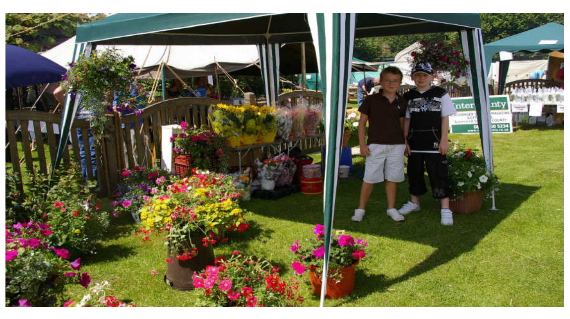
The school's plant stall first to sell out on fete day

It is important that the governing body has a full compliment of governors, particularly Parent Governors, so it is very much hoped that there will be a new elected member in place this term.