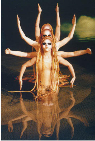
Cirque du Soleil's "O show"

The cirque de soleil "O" show is on at the Bellagio and is the only one in the World done over water. It was booked up solid, but I stood for two and a half hours in the cancellation queue and purchased the top price tickets for that performance. It was well worth it.