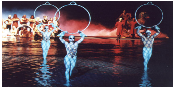
Another view of the "O show"

We certainly saw and did all we could in a short time. My gambling experience was sadly only on the one arm bandits as I felt that I was too inexperienced to gamble at the tables. We were talking Mega money bets there!