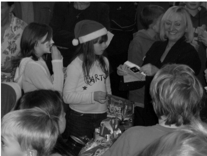
Another popular winner at the Bazaar

The Key Stage One Outdoor Play Area is nearing completion, but the project was a target for thieves who made off with a mini digger on the night of December 14 th at around 7pm in the evening. They accessed the school from the set aside, breaking down the perimeter fence in the process. Please tell the Stansted police if you saw anything that might help them in their efforts to apprehend the gang, who regularly target building sites in the area. They are seen on camera, but it could be your description of a particular vehicle, or someone acting suspiciously that might clinch an arrest. Did they also use this to pinch the Henry Moore Sculpture a few days later?