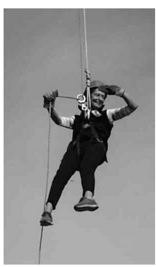
Ahoy there. I see no ships, only traffic and lots of lovely Essex countryside

The day raised £24,000 for charity in total. Ben and I hope to have raised well over £800 for Crossroads. Thank you for sponsoring me. Please let me have any amount you have pledged for Crossroads when you can. I look forward to repeating the experience next year. Thank you all for your support.