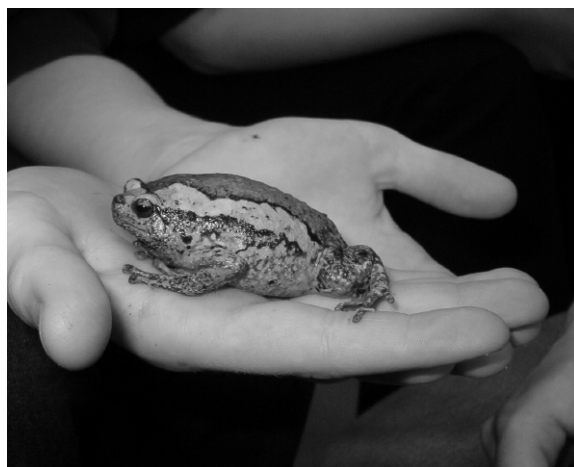
A Mud Puddle Frog from Costa Rica

to support the science curriculum such as the "Rainforest Road show" or the "Minibeasts Workshop". The presentations can be tailored to the individual school and cover subjects such