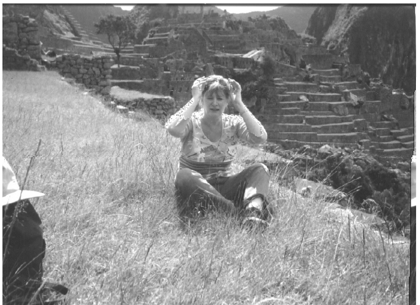
Sitting in front of the "Lost City" Machu Picchu