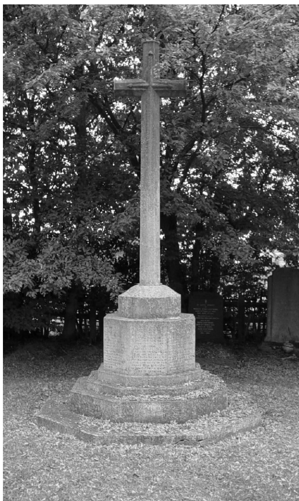
The War Memorial which has been standing in the Churchyard since 1919