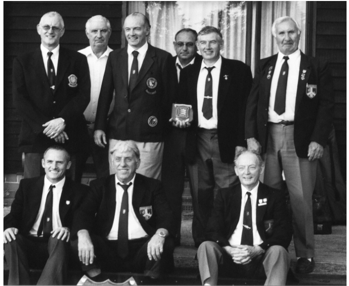
Birchanger Bowls Club Runners up in the Widdups Cup

The final was played away at Bocking and on the day the stronger and more tactical team won. Our team returned as runners up with a beautiful shield that was last won by Birchanger in 1975.