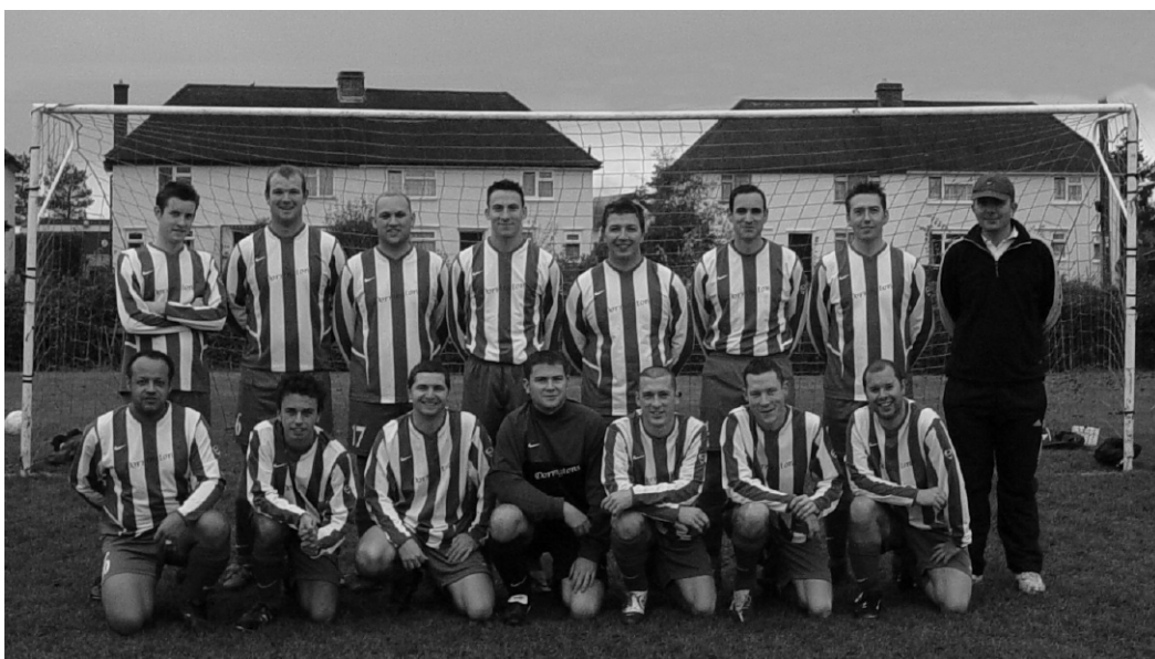
Social Club Birchanger in their new kit sponsored by Dorrington's

It was back to league action on 17 October as Birchanger were the hosts to The Natural Way (formerly The Wheatsheaf). The match was dominated by the home side but scoring opportunities were few and far between as the visitors defended well. Frustratingly, two well taken goals