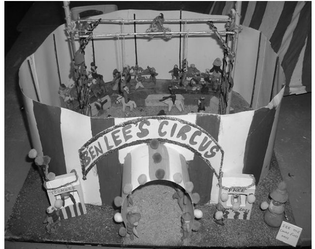
A view of our winning entry

For many weeks the cubs were making clowns, animals, high wire acts, candy floss stalls, the audience, the very impressive big top tent and various other circus pieces. The model and other entries were carefully transported to Dunmow and set up, where they were judged by an independent panel. Our Pack Model was good enough to win this year and we also were awarded certificates in the individual categories. Well done to everyone and a great reward for so much hard work.