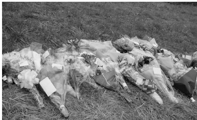
The floral tributes on the tuesday

In Duck End an intensive forensic examination of the area including residents gardens was carried out and more interviews of witnesses took place.